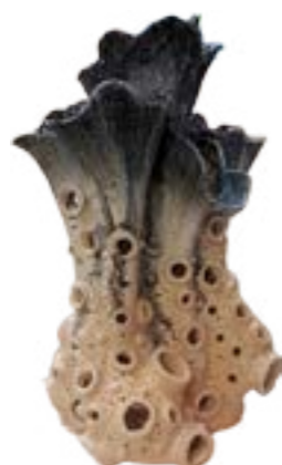
Title: Corel lamp Edition: 1/1 Material: Porcelain Dimensions: 61 cm high Price: Euro 2600