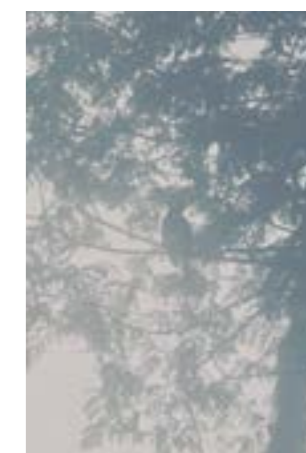
Title: Mantanani II Year: 2022 Price: Euro 850*