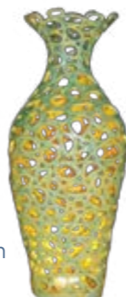
Title: Green Lamp Edition: 1/1 Material: Porcelain Dimensions: 60 cm high Price: Euro 2200