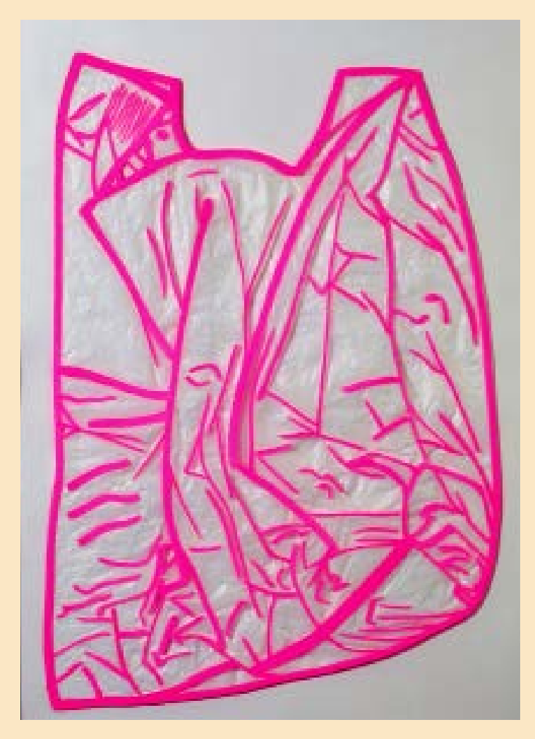
Work Title: Measurments: Price: